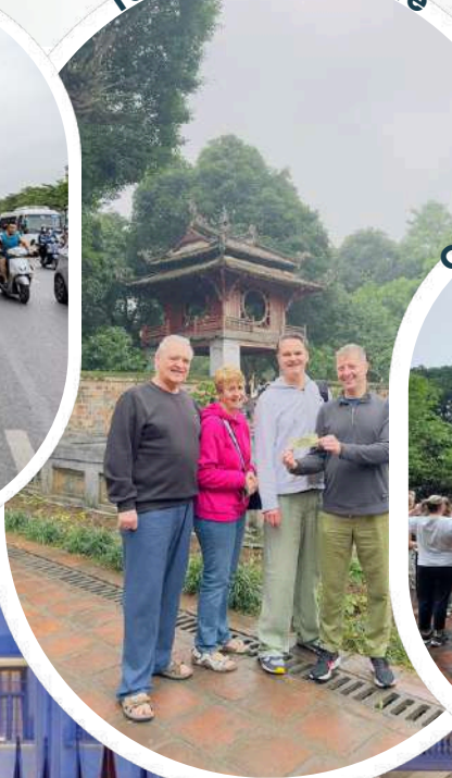
Temple of Literature