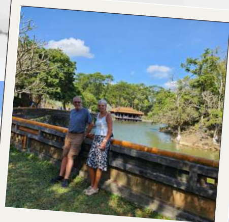
Tu Duc Tomb